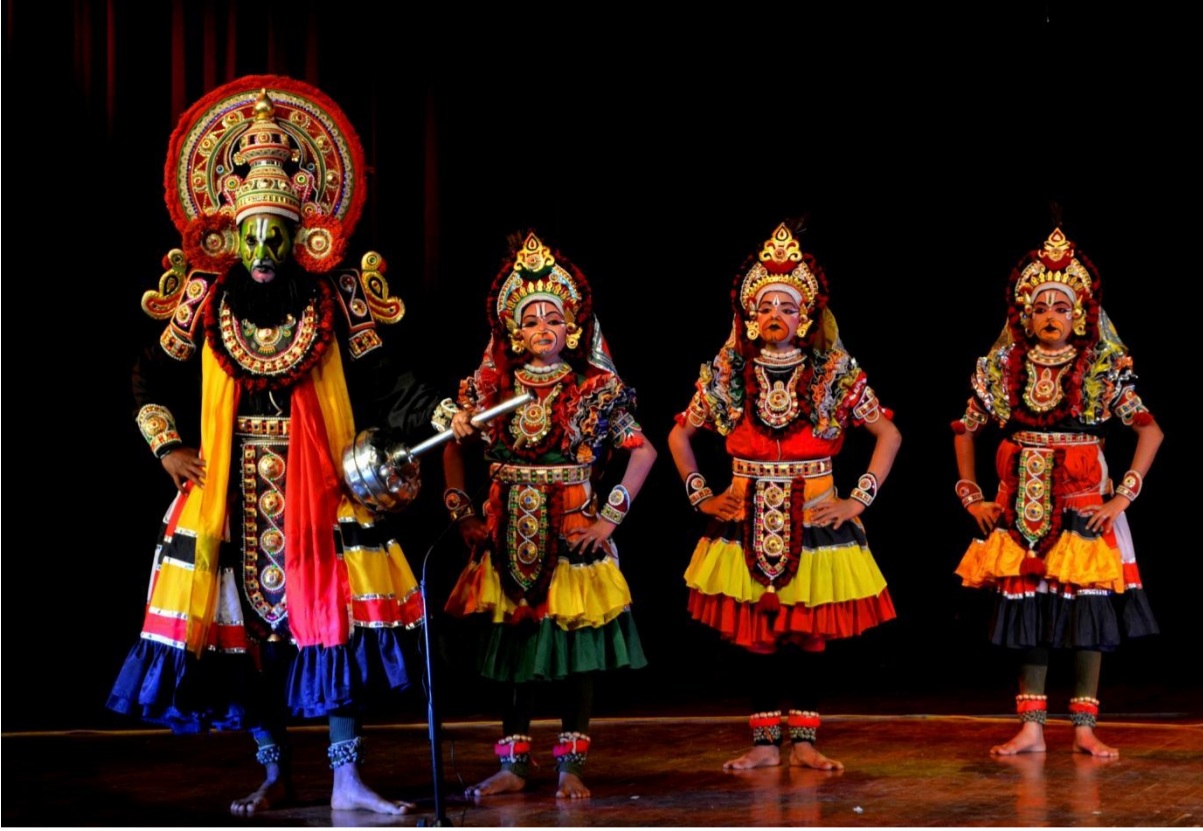
Mangalore University students performing Yakshagana