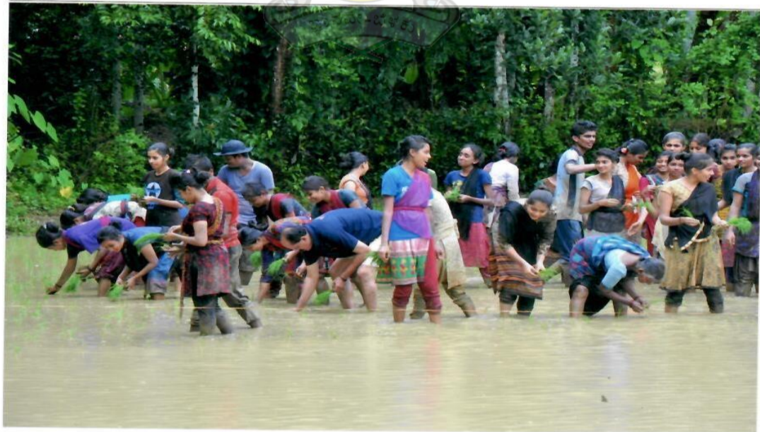
Sapling by Volunteers